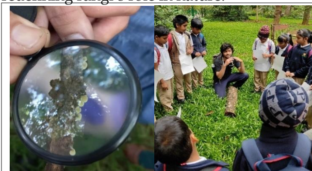
Magnifying the fun in finding 'Fun'gi

Communication, collaboration, and growth mindset blossomed through interactive learning, redefining fungi's role in nature.